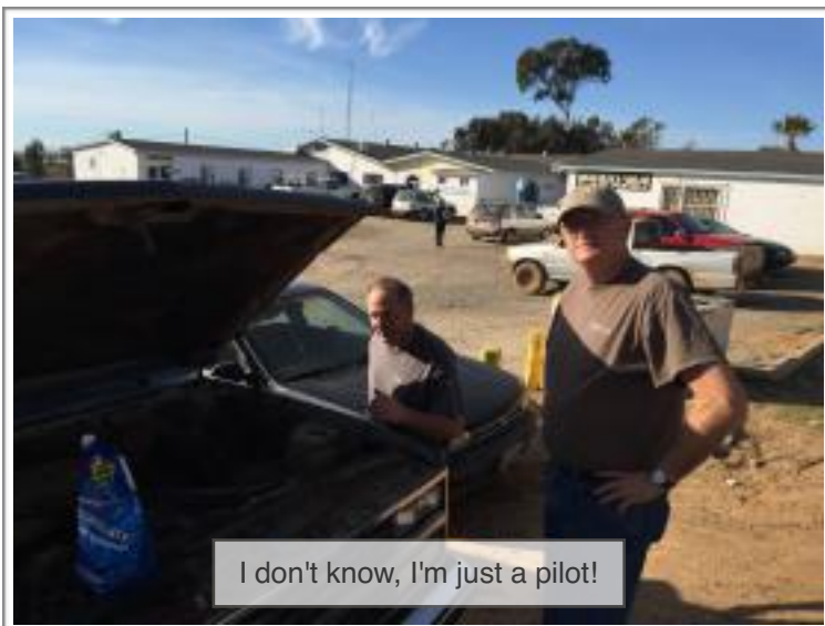
I don't know, I'm just a pilot!

consider joining us. You can contact me directly or through the FS at flyingsamsmail@yahoo.com