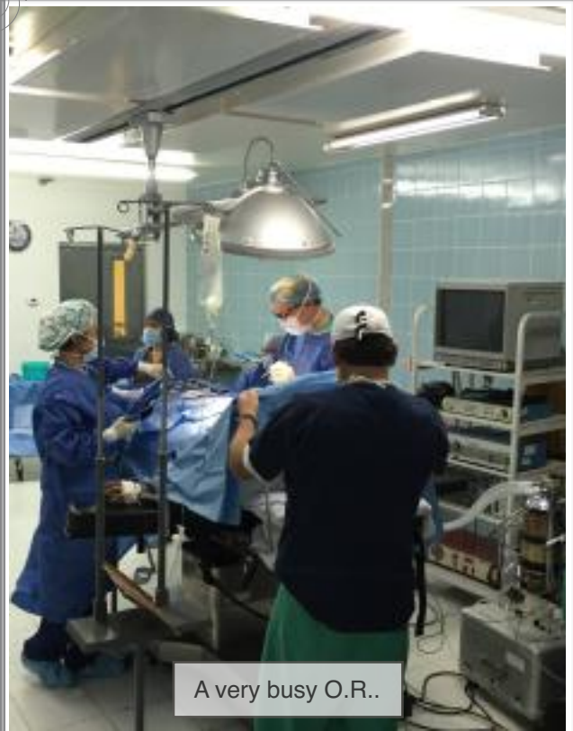
A very busy O.R..