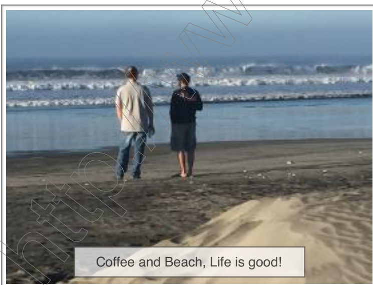
Coffee and Beach, Life is good!

Sunday morning was a leisurely start. Postoperative care was performed and all aircraft headed for home. Clear skies and fair winds made for an uneventful flight.