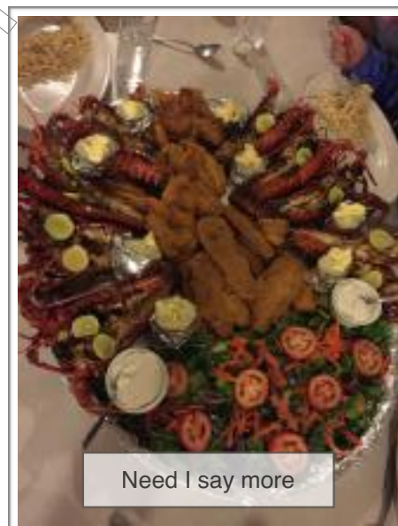
Need I say more